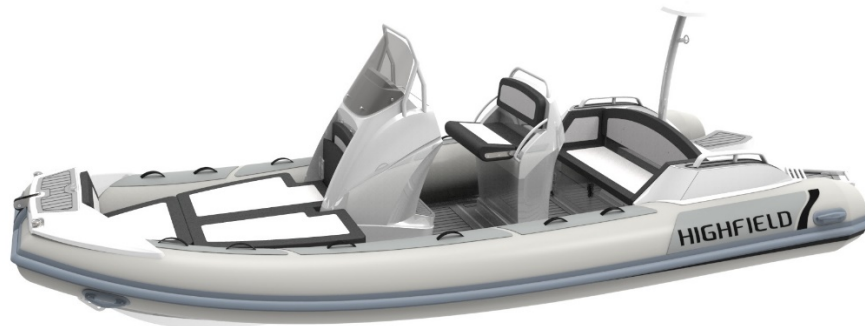
Highfield SPORT 560

The 300-360 models are compact, easy-to-store RIBs featuring three lifting points, excellent weight distribution, integrated fuel tanks and a well-thought-out interior layout. These small RIBs make the perfect tender for a wide range of power and sailboats. The 390-460 models, which have fuel tanks tucked out of the way below the deck, are the ideal fit for larger decks and swim platforms. These RIBs also can double as day boats, sought out for their layout, ergonomics and fine attention to detail.