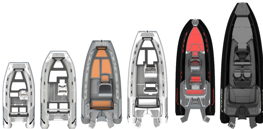
The new Sport RIB Line includes 11 new models from 10' to 26'.

CANTON, GA – August 1, 2020 – Highfield Boats , the world’s leading manufacturer of aluminum RIBS and tenders, is proud to announce it will launch the brand new Highfield SPORT collection of rigid inflatable boats (RIBs) this fall for the 2021 model year. Representing the next generation of design and construction technology for Highfield Boats, and outfitted with a host of upgraded features, these sleek, stable and seaworthy RIBs make ideal tenders for luxury power and sailing yachts. The larger models also will serve owners as versatile day boats accommodating a host of adventures on the water.