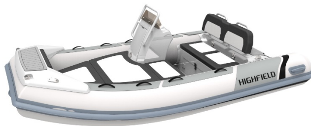
Highfield SPORT 360

The Highfield SPORT collection features a new, Italian-inspired interior design that is sure to turn heads in the marina. Most of the SPORT models are engineered with completely new hulls, new decks, or both. High-quality EVA foam faux-teak decking, LED lighting, luxury diamond-stitch upholstery, and electric bilge pumps are standard equipment on all RIBS. Models starting with the SP520 and larger also are equipped with swim platforms with easy-to-climb telescopic ladders. The long list of options for the series includes watersports tow posts and bimini tops; sunpads and sport arches are available on the larger models as well as built-in freshwater showers. Owners also can choose from six different color options for their new SPORT RIB.