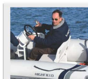
Console & seat